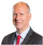
David Rees AM (Chair) Welsh Labour Aberavon