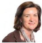
Eluned Morgan AM Welsh Labour Mid and West Wales